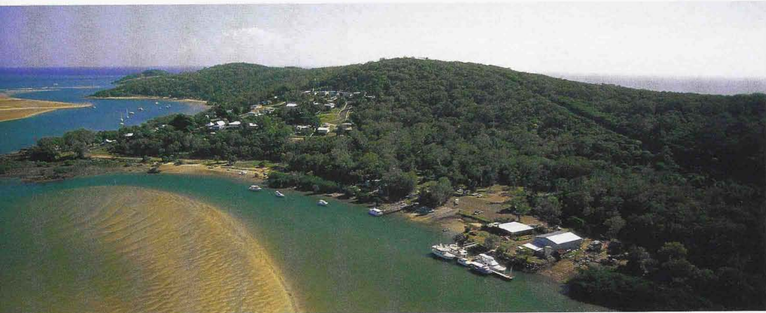
The unspoilt position of Queensland's Town of 1770 is attracting city investors.

Eurimbula National Park, a popular camping spot. On our way back, we stopped at Middle Island and took turns sliding down the sand dunes that rise dramatically from the beach. Later, from the rugged cliff top at Round Hill Head, we watched the sun set while dolphins and turtles swam in the clear blue sea below, surrounded by tussock grasslands, pandanus, acacias, banksias and eucalypts – all part of the Joseph Banks Environmental Park.