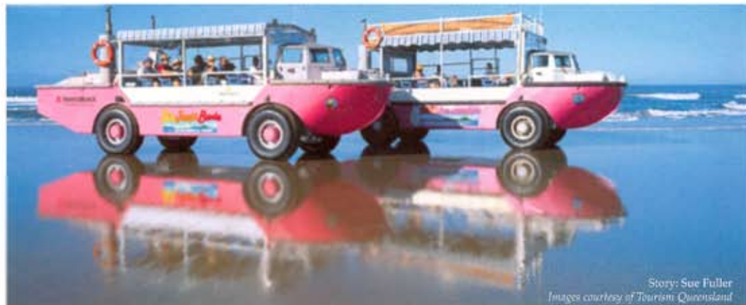
Story: Sue Fuller

1770 road has a community centre that welcomes visitors to the rugged beauty of the area.